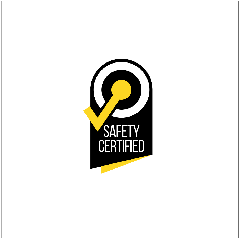
Full colour on white