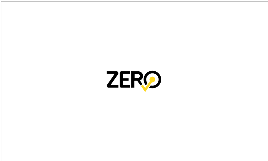
Less than 55 mm - no trademark