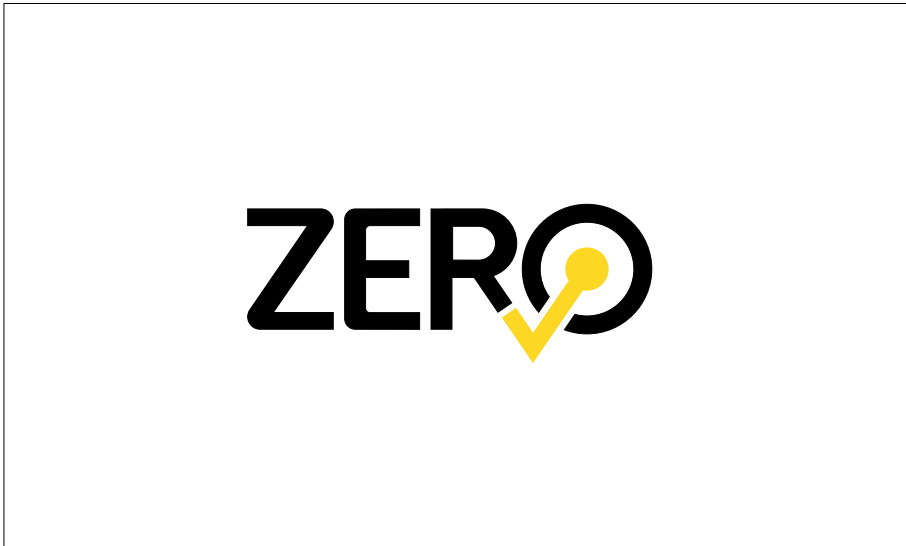
Full colour on white