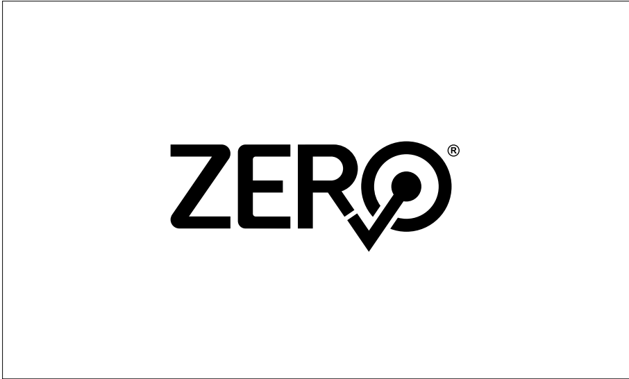
Black on white