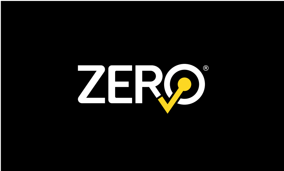
Full colour on black